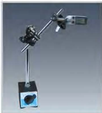
Middle Mold Detector

Vacuum Device. (Vacuum generator, magnetic valve and standard vacuum tool.)